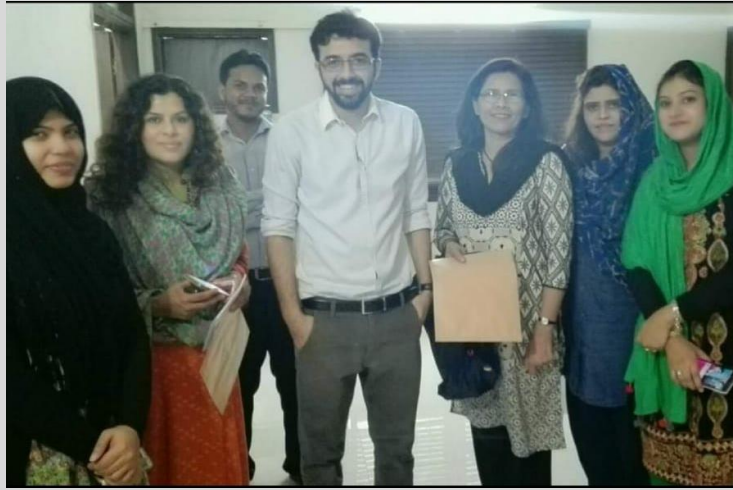
'Session with members of women chamber of Commerce'