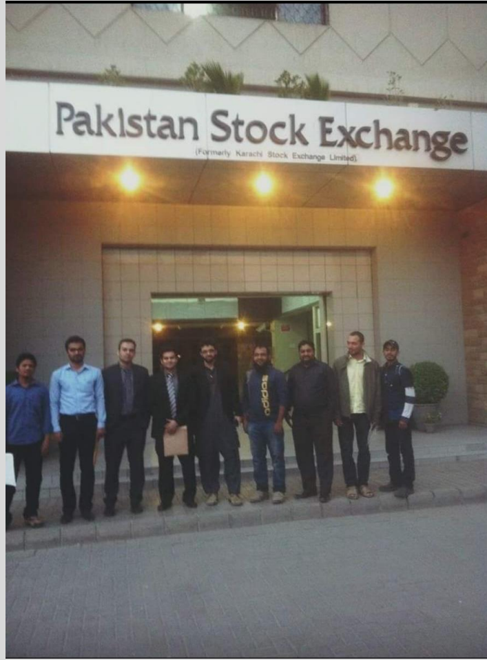
'Tour of Pakistan Stock Exchange'