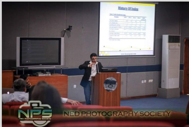
'Session in NED University'