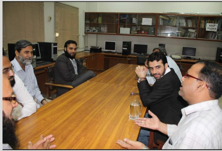
'Stock discussion with directors of NED'