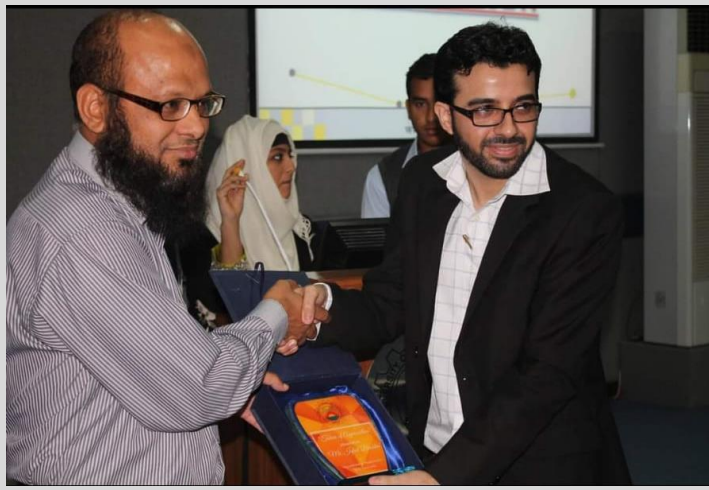
'Receiving certificate of appreciation from NED Chairman'