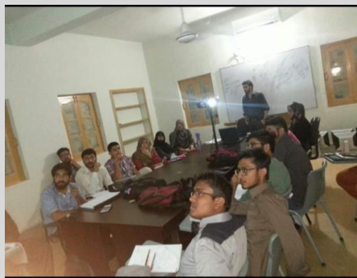
'Stock Exchange session with CA Students'