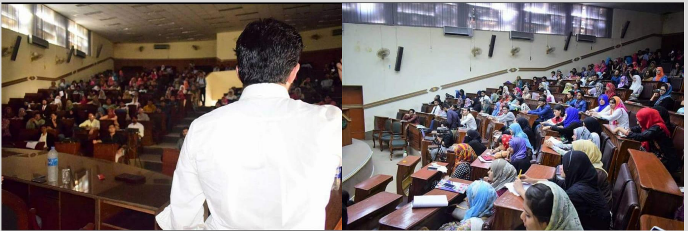
'Session in Karachi University'